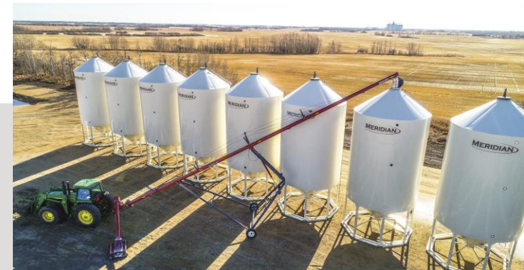
1630 - Can hold up to 154 ton of TerraNu

If you have any questions or are ready to sign up, contact your local TerraNu rep for more information.